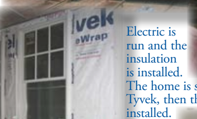
Electric is run and the insulation is installed. The home is sheathed, wrapped with Tyvek, then the windows and siding are installed.