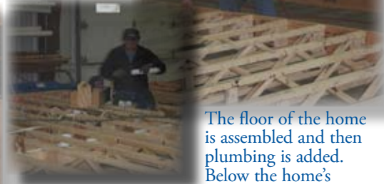
The floor of the home is assembled and then plumbing is added. Below the home's dormers are built.